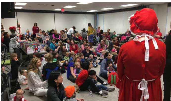
Story time at the Forsyth community literacy event.

LITERACY FORSYTH PARTNERED with the Forsyth County Public Libraries, Georgia Highlands Medical Group, and the Forsyth County Board of Education to provide a community literacy event. This event, held at the Georgia Highlands Medical Group conference room, highlighted the importance of parents reading to children from birth through pre-k. Forsyth County Public Library provided a puppet show, story time, and sing-a-longs. The children made a craft and received a goodie bag while the parents received instruction from the Forsyth County Board of Education on how to read to young children. Literacy Forsyth solicited the generous donation of 120 hardcover books from North Georgia Altrusa and Barnes & Noble. This collaborative event is the first in a series of events to be held throughout Forsyth County starting in 2018.