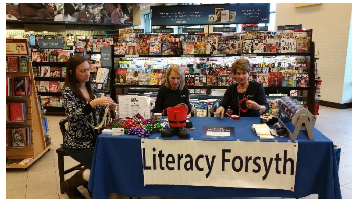
Literacy Forsyth's Day of Wrapping at Barnes & Noble.

A DAY OF WRAPPING was held at Barnes & Noble on December 16. Volunteers from the Literacy Forsyth Board of Directors, students, and Altrusa members all helped to wrap gifts, raise money, and increase literacy awareness.