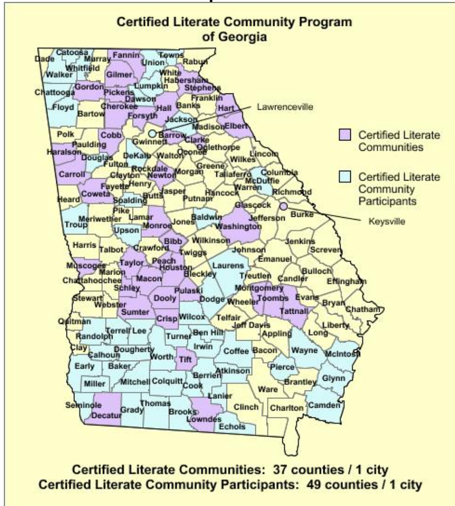
CLCP Communities in Georgia as of 6/30/14

In 2014 CLCP communities served 22,735 Adult Education students who improved their literacy levels or obtained a GED diploma.